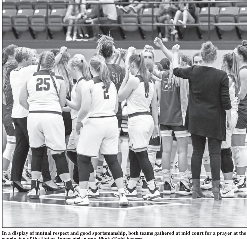
conclusion of the Union-Towns girls game.

Chambers as the Lady Panthers equaled its largest lead of the night with the 70-34 final.